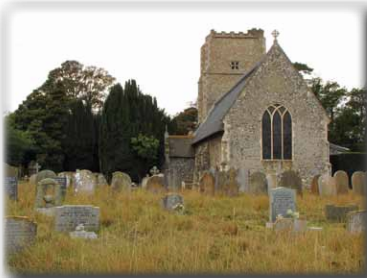
All Saints Church, Salhouse